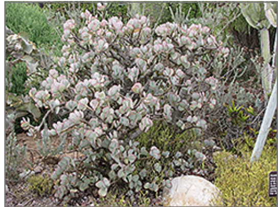
Silver Dollar Plant

Silver Dollar Plant is recommended for the following landscape applications;