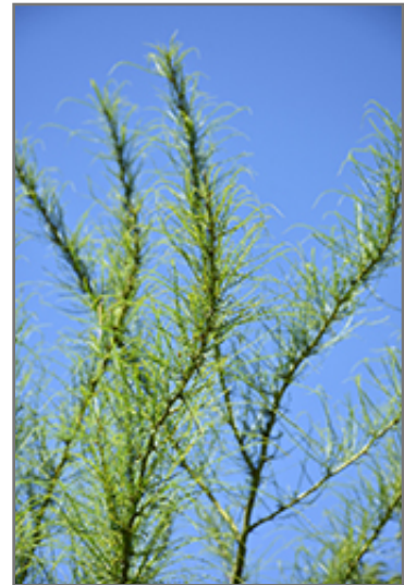
Mexican Palo Verde foliage

This tree does best in full sun to partial shade. It prefers dry to average moisture levels with very well-drained soil, and will often die in standing water. It is considered to be drought-tolerant, and thus makes an ideal choice for xeriscaping or the moisture-conserving landscape. It is not particular as to soil type or pH. It is somewhat tolerant of urban pollution. This species is native to parts of North America.