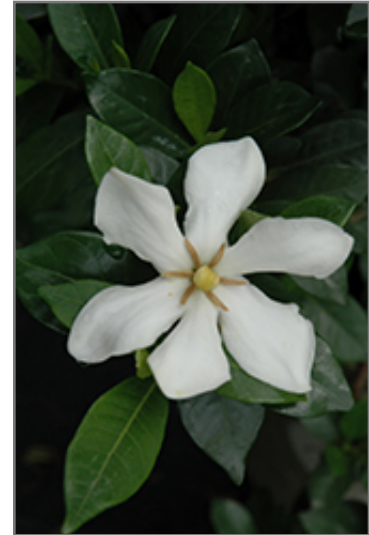
Pinwheel Gardenia flowers

Pinwheel Gardenia will grow to be about 4 feet tall at maturity, with a spread of 4 feet. It has a low canopy. It grows at a slow rate, and under ideal conditions can be expected to live for approximately 30 years.