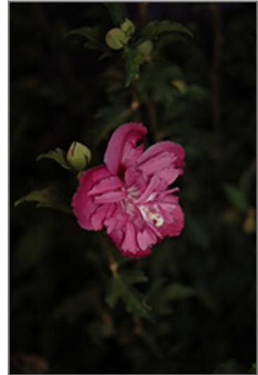
Raspberry Smoothie Rose of Sharon flowers

Raspberry Smoothie Rose of Sharon is recommended for the following landscape applications;