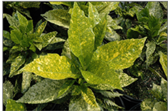
Golden King Aucuba foliage

Golden King Aucuba will grow to be about 8 feet tall at maturity, with a spread of 8 feet. It has a low canopy, and is suitable for planting under power lines. It grows at a slow rate, and under ideal conditions can be expected to live for approximately 20 years.