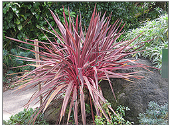
Electric Pink Cordyline

Electric Pink Cordyline is recommended for the following landscape applications;