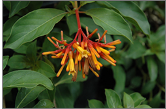
Dwarf Firebush flowers

Dwarf Firebush is recommended for the following landscape applications;