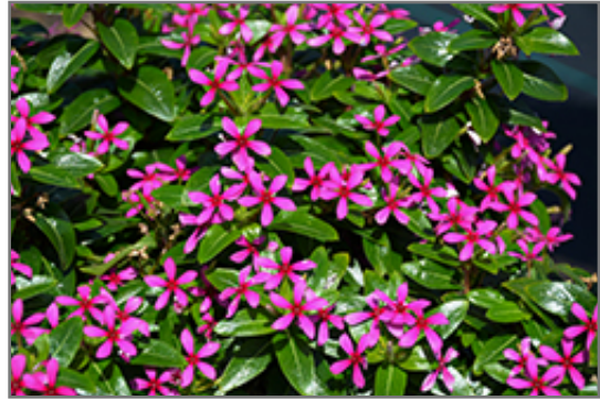
Soiree Kawaii Lavender Vinca flowers