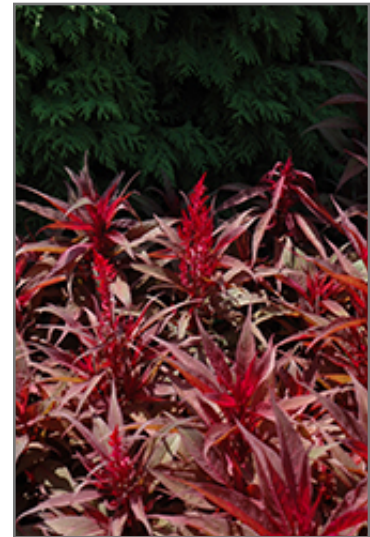
Dragon's Breath Plumed Celosia flowers

This plant will require occasional maintenance and upkeep, and should be cut back in late fall in preparation for winter. It is a good choice for attracting butterflies to your yard, but is not particularly attractive to deer who tend to leave it alone in favor of tastier treats. It has no significant negative characteristics.