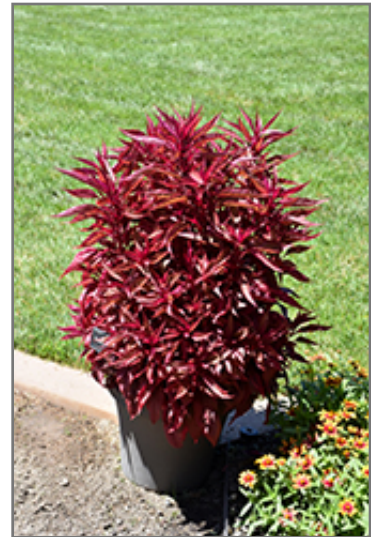
Dragon's Breath Plumed Celosia

Dragon's Breath Plumed Celosia will grow to be about 20 inches tall at maturity, with a spread of 16 inches. When grown in masses or used as a bedding plant, individual plants should be spaced approximately 12 inches apart. Its foliage tends to remain dense right to the ground, not requiring facer plants in front. This fast-growing annual will normally live for one full growing season, needing replacement the following year.