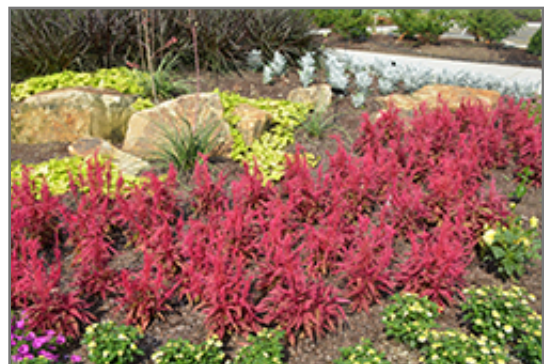
Dragon's Breath Plumed Celosia in bloom