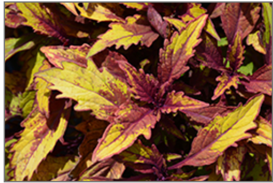
FlameThrower Spiced Curry Coleus foliage

FlameThrower Spiced Curry Coleus is recommended for the following landscape applications;