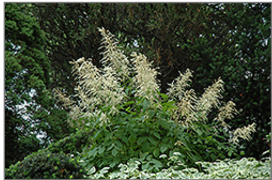
Goatsbeard in bloom