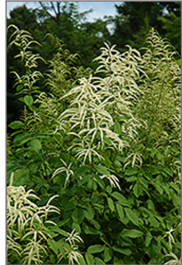
Goatsbeard flowers

Goatsbeard is recommended for the following landscape applications;