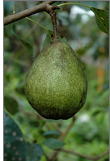
Kieffer Pear fruit

This is a dense deciduous tree with an upright spreading habit of growth. Its average texture blends into the landscape, but can be balanced by one or two finer or coarser trees or shrubs for an effective composition. This is a high maintenance plant that will require regular care and upkeep, and is best pruned in late winter once the threat of extreme cold has passed. Gardeners should be aware of the following characteristic(s) that may warrant special consideration;