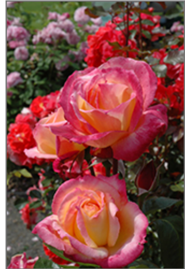
Broadway Rose flowers