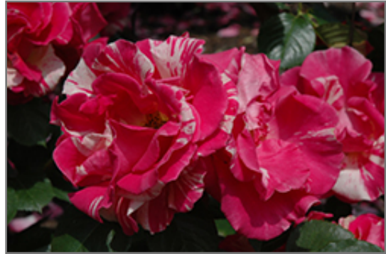
Candy Land Rose flowers