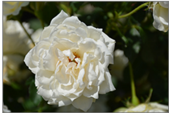
Icecap Rose flowers