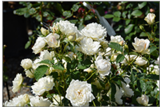
Icecap Rose flowers