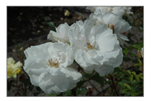
Sir Thomas Lipton Rose flowers

Bandera Location 8516 Bandera Road San Antonio, TX 78250 (210) 680-2394