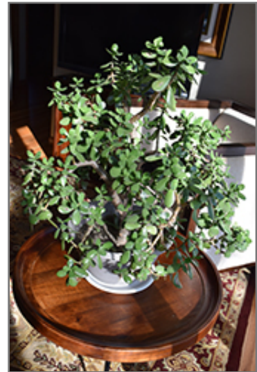
Jade Plant in full

This is a multi-stemmed evergreen houseplant with an upright spreading habit of growth. This plant can be pruned at any time to keep it looking its best.