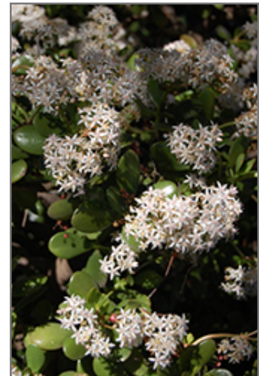
Jade Plant flowers