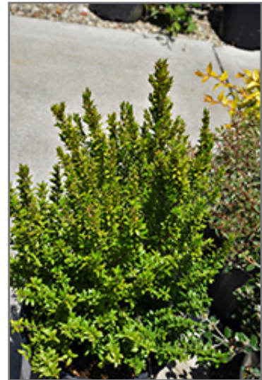
Dwarf Myrtle

There are many factors that will affect the ultimate height, spread and overall performance of a plant when grown indoors; among them, the size of the pot it's growing in, the amount of light it receives, watering frequency, the pruning regimen and repotting schedule. Use the information described here as a guideline only; individual performance can and will vary. Please contact the store to speak with one of our experts if you are interested in further details concerning recommendations on pot size, watering, pruning, repotting, etc.