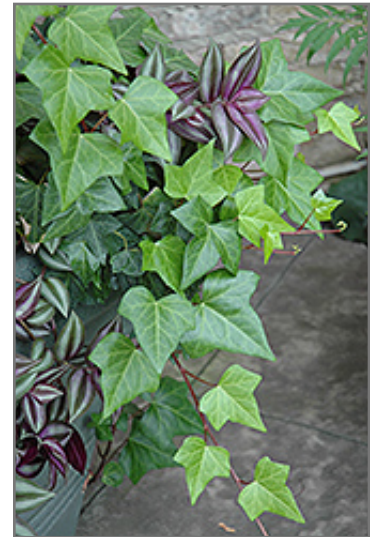
Algerian Ivy foliage

When grown indoors, Algerian Ivy can be expected to grow to be about 10 feet tall at maturity, with a spread of 3 feet. It grows at a fast rate, and under ideal conditions can be expected to live for approximately 30 years. This houseplant performs well in both bright or indirect sunlight and strong artificial light, and can therefore be situated in almost any well-lit room or location. It is very adaptable to both dry and moist soil, and should do just fine under average home conditions. The surface of the soil shouldn't be allowed to dry out completely, and so you should expect to water this plant once and possibly even twice each week. Be aware that your particular watering schedule may vary depending on its location in the room, the pot size, plant size and other conditions; if in doubt, ask one of our experts in the store for advice. It is not particular as to soil pH, but grows best in rich soil. Contact the store for specific recommendations on pre-mixed potting soil for this plant. Be warned that parts of this plant are known to be toxic to humans and animals, so special care should be exercised if growing it around children and pets.