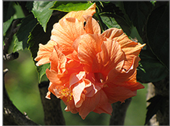
Double Orange Hibiscus flowers