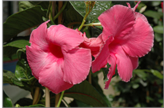
Alice Du Pont Mandevilla flowers

When grown indoors, Alice Du Pont Mandevilla can be expected to grow to be about 12 feet tall at maturity, with a spread of 24 inches. It grows at a medium rate, and under ideal conditions can be expected to live for approximately 20 years. This houseplant will do well in a location that gets either direct or indirect sunlight, although it will usually require a more brightly-lit environment than what artificial indoor lighting alone can provide. It requires an evenly moist well-drained soil for optimal growth. The surface of the soil shouldn't be allowed to dry out completely, and so you should expect to water this plant once and possibly even twice each week. Be aware that your particular watering schedule may vary depending on its location in the room, the pot size, plant size and other conditions; if in doubt, ask one of our experts in the store for advice. It is not particular as to soil type or pH; an average potting soil should work just fine. Be warned that parts of this plant are known to be toxic to humans and animals, so special care should be exercised if growing it around children and pets.