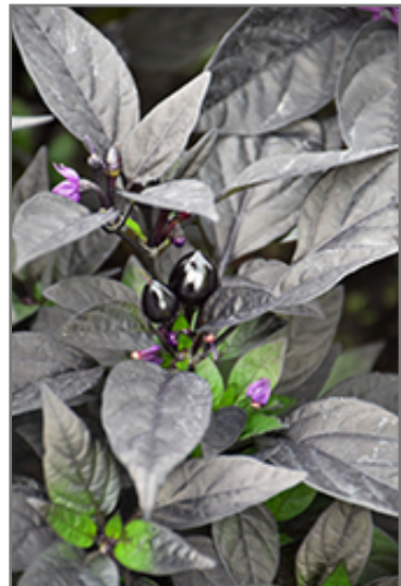
Black Pearl Ornamental Pepper fruit