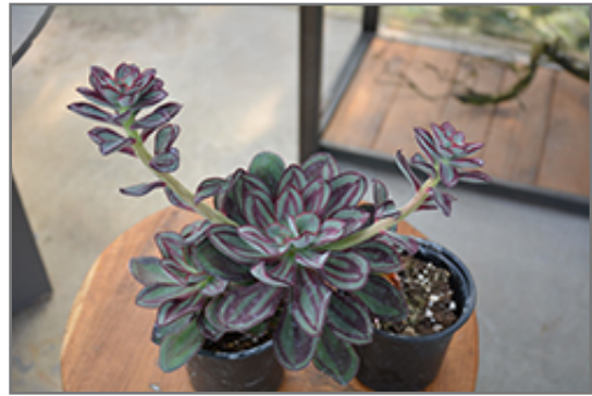
Painted Echeveria in full