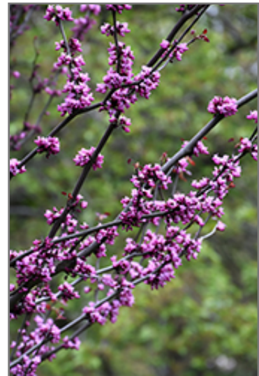
Merlot Redbud flowers