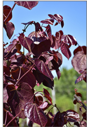
Merlot Redbud foliage