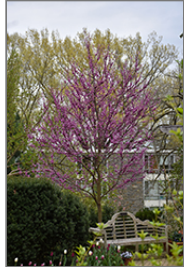
Merlot Redbud in bloom

This tree does best in full sun to partial shade. It prefers to grow in average to moist conditions, and shouldn't be allowed to dry out. It may require supplemental watering during periods of drought or extended heat. It is not particular as to soil type or pH. It is highly tolerant of urban pollution and will even thrive in inner city environments, and will benefit from being planted in a relatively sheltered location. Consider applying a thick mulch around the root zone in winter to protect it in exposed locations or colder microclimates. This is a selection of a native North American species.