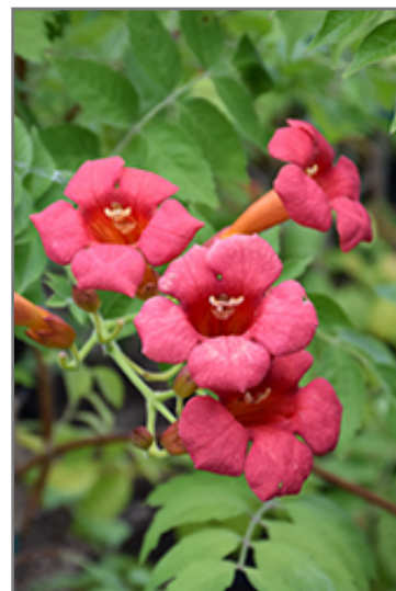
Madame Rosy Trumpetvine flowers

Bandera Location 8516 Bandera Road San Antonio, TX 78250 (210) 680-2394