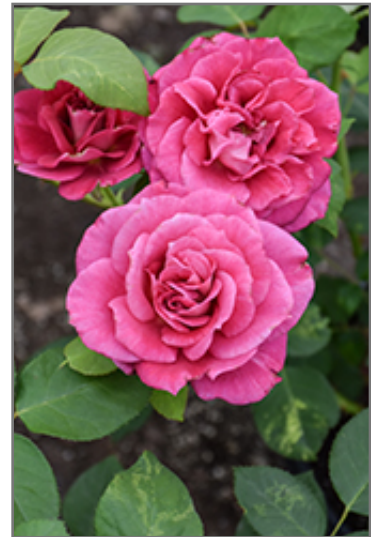
Girls' Night Out Rose flowers