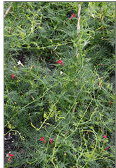
Cypress Vine in bloom