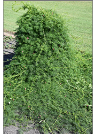
Cypress Vine