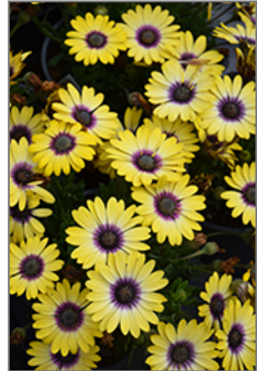
Blue Eyed Beauty African Daisy flowers