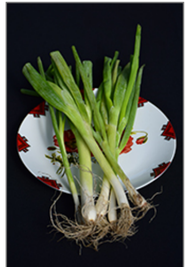
Spring Onion fruit