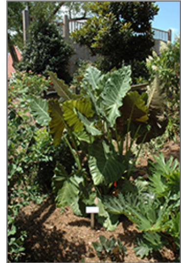
Yucatan Princess Elephant's Ear

This plant does best in full sun to partial shade. It is quite adaptable, preferring to grow in average to wet conditions, and will even tolerate some standing water. It may require supplemental watering during periods of drought or extended heat. It is not particular as to soil pH, but grows best in rich soils. It is somewhat tolerant of urban pollution. This is a selected variety of a species not originally from North America, and parts of it are known to be toxic to humans and animals, so care should be exercised in planting it around children and pets.