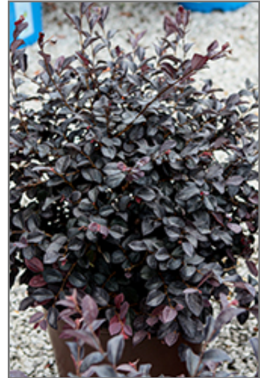
Cherry Blast Fringeflower

Cherry Blast Fringeflower makes a fine choice for the outdoor landscape, but it is also well-suited for use in outdoor pots and containers. Because of its height, it is often used as a 'thriller' in the 'spiller-thriller-filler' container combination; plant it near the center of the pot, surrounded by smaller plants and those that spill over the edges. It is even sizeable enough that it can be grown alone in a suitable container. Note that when grown in a container, it may not perform exactly as indicated on the tag - this is to be expected. Also note that when growing plants in outdoor containers and baskets, they may require more frequent waterings than they would in the yard or garden.