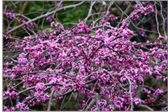
Traveller Weeping Redbud flowers