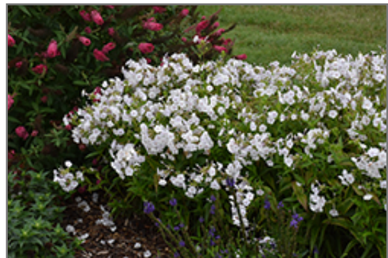
Fashionably Early Crystal Garden Phlox in bloom