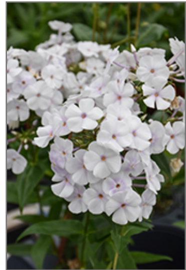
Fashionably Early Crystal Garden Phlox flowers

Fashionably Early Crystal Garden Phlox is a dense herbaceous perennial with an upright spreading habit of growth. Its medium texture blends into the garden, but can always be balanced by a couple of finer or coarser plants for an effective composition.