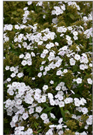
Fashionably Early Crystal Garden Phlox flowers

Fashionably Early Crystal Garden Phlox is a fine choice for the garden, but it is also a good selection for planting in outdoor pots and containers. With its upright habit of growth, it is best suited for use as a 'thriller' in the 'spiller-thriller-filler' container combination; plant it near the center of the pot, surrounded by smaller plants and those that spill over the edges. It is even sizeable enough that it can be grown alone in a suitable container. Note that when growing plants in outdoor containers and baskets, they may require more frequent waterings than they would in the yard or garden.