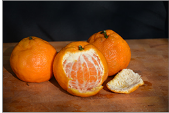
Satsuma Mandarin Orange fruit and flesh

There are many factors that will affect the ultimate height, spread and overall performance of a plant when grown indoors; among them, the size of the pot it's growing in, the amount of light it receives, watering frequency, the pruning regimen and repotting schedule. Use the information described here as a guideline only; individual performance can and will vary. Please contact the store to speak with one of our experts if you are interested in further details concerning recommendations on pot size, watering, pruning, repotting, etc.