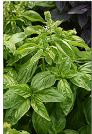
Genovese Basil foliage

Genovese Basil will grow to be about 20 inches tall at maturity, with a spread of 14 inches. When grown in masses or used as a bedding plant, individual plants should be spaced approximately 12 inches apart. This fast-growing annual will normally live for one full growing season, needing replacement the following year.