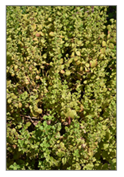
Citronella Lemon Balm foliage

Bandera Location 8516 Bandera Road San Antonio, TX 78250 (210) 680-2394