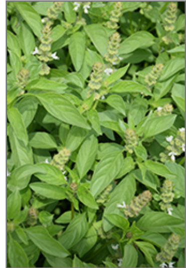
Lime Basil foliage

Lime Basil will grow to be about 20 inches tall at maturity, with a spread of 20 inches. When grown in masses or used as a bedding plant, individual plants should be spaced approximately 16 inches apart. This fast-growing annual will normally live for one full growing season, needing replacement the following year.