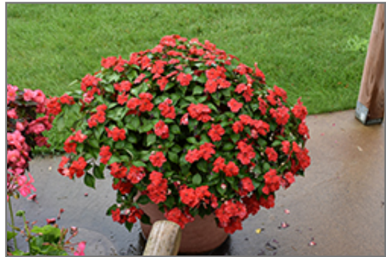
Beacon Bright Red Impatiens flowers

Beacon Bright Red Impatiens is recommended for the following landscape applications;