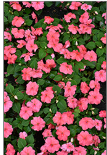
Beacon Coral Impatiens flowers

Beacon Coral Impatiens is recommended for the following landscape applications;