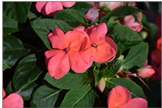
Beacon Coral Impatiens flowers