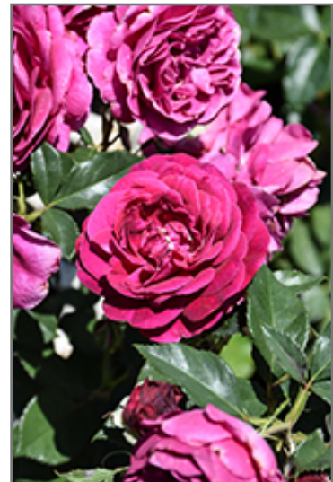
Celestial Night Rose flowers