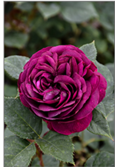
Celestial Night Rose flowers