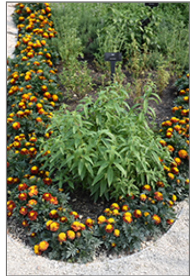
Lemon Verbena

Lemon Verbena features subtle spikes of fragrant white bell-shaped flowers at the ends of the branches from mid summer to early fall. It has emerald green evergreen foliage. The fragrant narrow leaves remain emerald green throughout the winter.