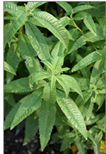
Lemon Verbena foliage