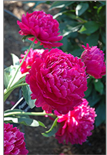
Paul Wild Peony flowers

Paul Wild Peony will grow to be about 30 inches tall at maturity, with a spread of 3 feet. When grown in masses or used as a bedding plant, individual plants should be spaced approximately 30 inches apart. The flower stalks can be weak and so it may require staking in exposed sites or excessively rich soils. It grows at a slow rate, and under ideal conditions can be expected to live for approximately 20 years. As an herbaceous perennial, this plant will usually die back to the crown each winter, and will regrow from the base each spring. Be careful not to disturb the crown in late winter when it may not be readily seen!