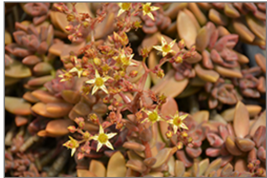
Vera Higgins Graptosedum flowers