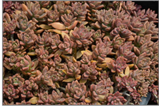
Vera Higgins Graptosedum

Vera Higgins Graptosedum is a dense herbaceous evergreen perennial with an upright spreading habit of growth. Its medium texture blends into the garden, but can always be balanced by a couple of finer or coarser plants for an effective composition.