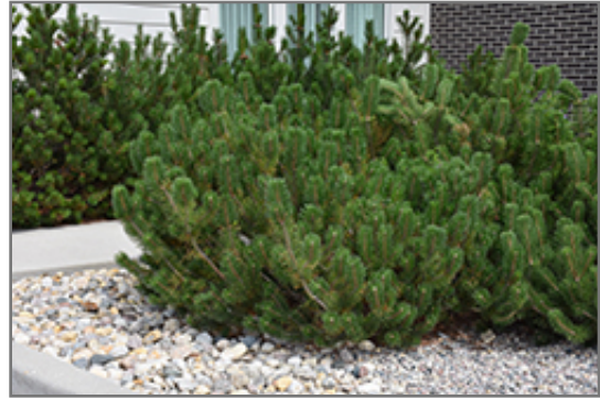
Mugo Pine