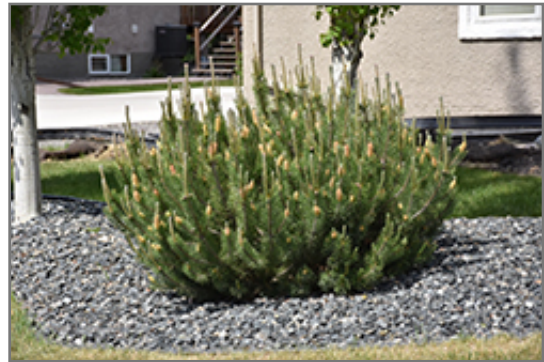
Mugo Pine