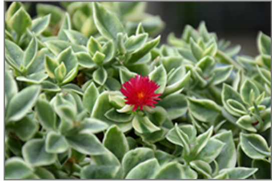
Variegated Baby Sun Rose flowers

Variegated Baby Sun Rose is recommended for the following landscape applications;