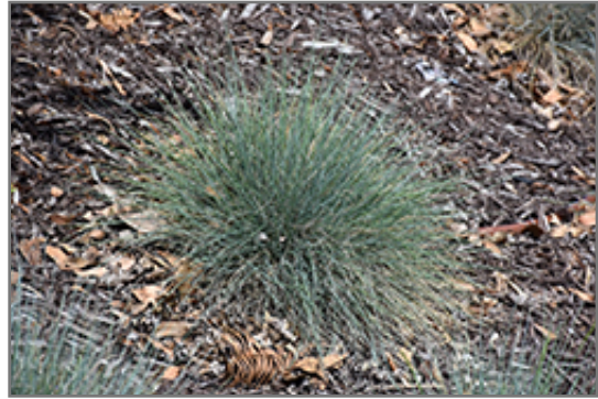
Boulder Blue Fescue

Boulder Blue Fescue is recommended for the following landscape applications;