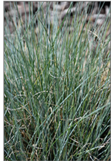
Boulder Blue Fescue foliage