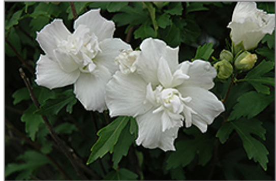
Jeanne D'Arc Rose Of Sharon flowers

Jeanne D'Arc Rose Of Sharon is recommended for the following landscape applications;