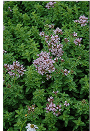
Dwarf Oregano flowers

Aside from its primary use as an edible, Dwarf Oregano is suitable for the following landscape applications;