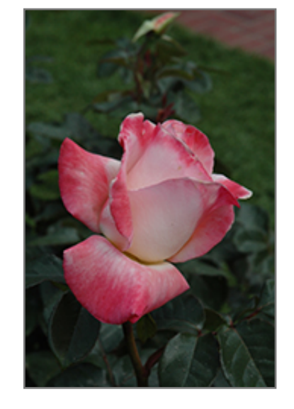
Gemini Rose flowers