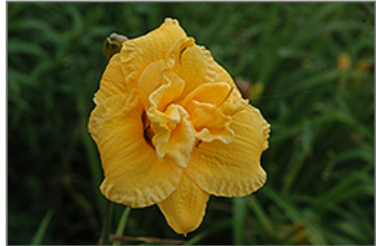
Double Dream Daylily flowers

Double Dream Daylily will grow to be about 30 inches tall at maturity, with a spread of 3 feet. When grown in masses or used as a bedding plant, individual plants should be spaced approximately 30 inches apart. It grows at a medium rate, and under ideal conditions can be expected to live for approximately 10 years. As an herbaceous perennial, this plant will usually die back to the crown each winter, and will regrow from the base each spring. Be careful not to disturb the crown in late winter when it may not be readily seen!